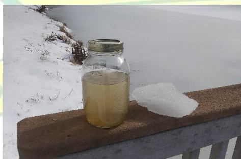
Jar of Lake Neff with 2" thick chunk of ice

Fortunately, I still had an aluminum bat my boys used in Little League (yes, I need to clean out my trunk I guess). I am sure I gave the fish quite the